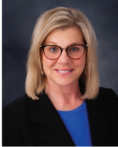
WDB JPB Chair

Work Sherburne County 13880 Hwy. 10 Elk River, MN 55330