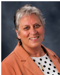
JPB Secretary WDB Member