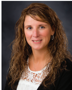
Committee Vice Chair

Work ♦ Elk River Area School District, ISD 728 11500 193 rd Ave. NW Elk River, MN 55330