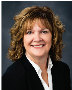
JPB Vice Chair WDB Member