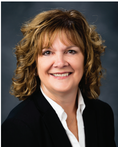
WDB JPB Vice Chair

Work ♦ Commissioner Wright County 3650 Braddock Ave. NE Buffalo, MN 55313