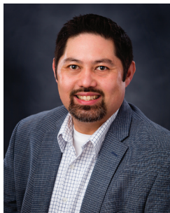
Vice Chair WDB

Work ◆ Financial Advisor Edward Jones 1 First Ave. S Buffalo, MN 55313