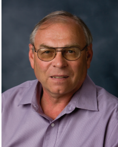
JPB Secretary WDB Member

Work Isanti County Government Center 555 18 th Ave. SW Cambridge, MN 55008