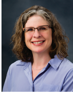
Committee Vice Chair WDB

Work ♦ Metro North Elk River Adult Basic Education 1170 Main Street NW Elk River, MN 55330